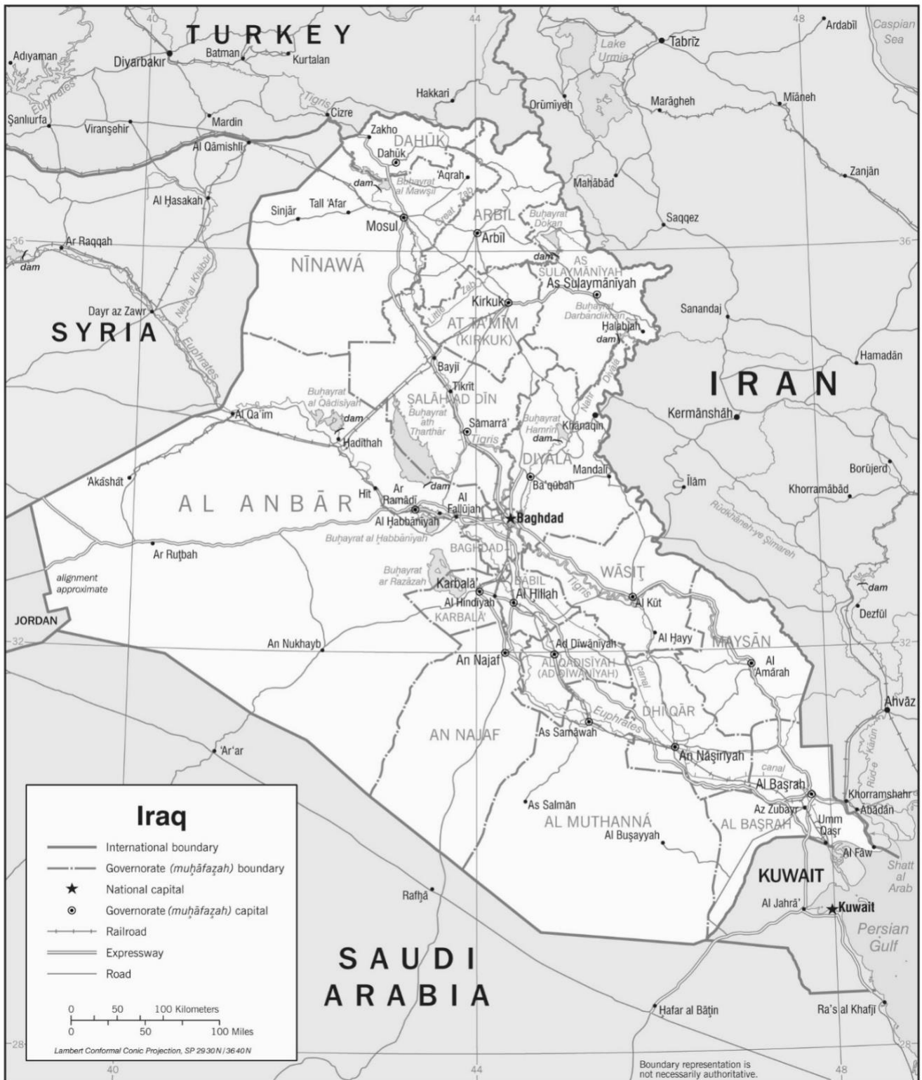
Map of Iraq: The University of Texas at Austin, “The Perry-Castañeda Library, Middle East Maps,” 2024.