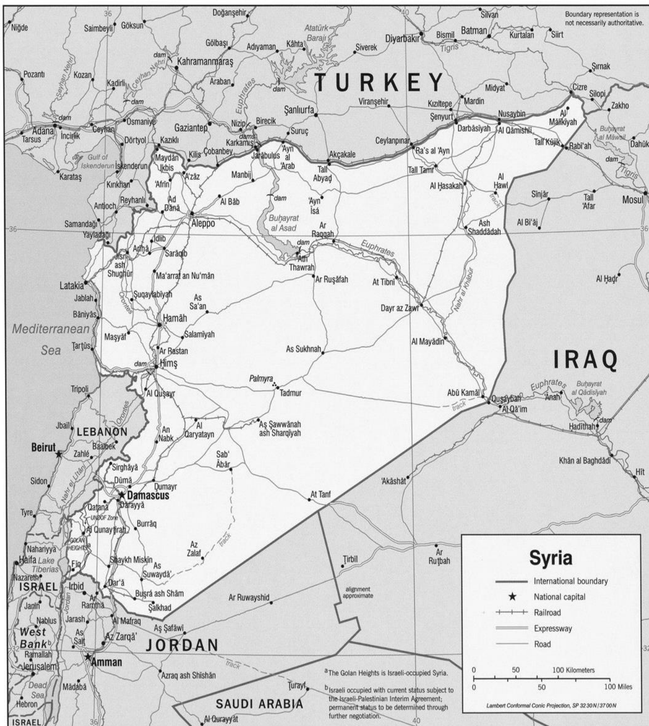
Map of Syria: The University of Texas at Austin, “The Perry-Castañeda Library, Middle East Maps,” 2024.